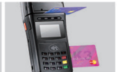
various payment options