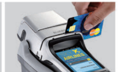
various payment options