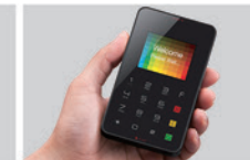
compact and light