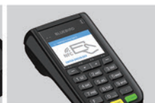
SDK and Win CE 6.0