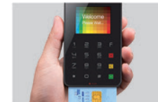
chip and pin

EP200 can be paired with iOS, Android and Windows. We also provide comprehensive SDK (Software development kit) support so anyone can develop applications and customize it for unique business needs.