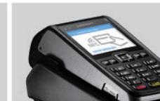
all-day battery life