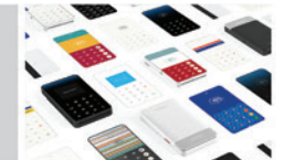
thousands of faces